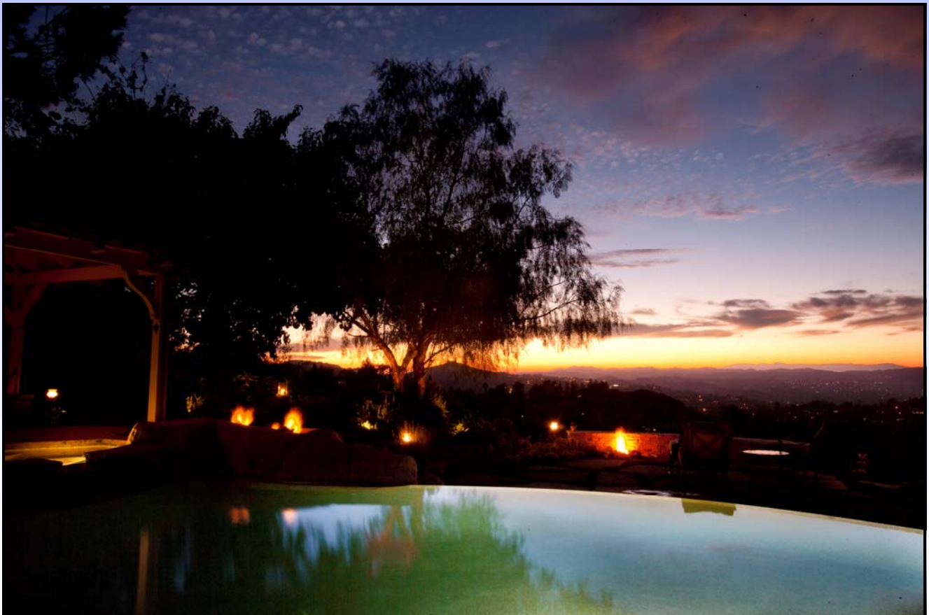
Nick Williams Designs-Pool, Lights and Fire Pits