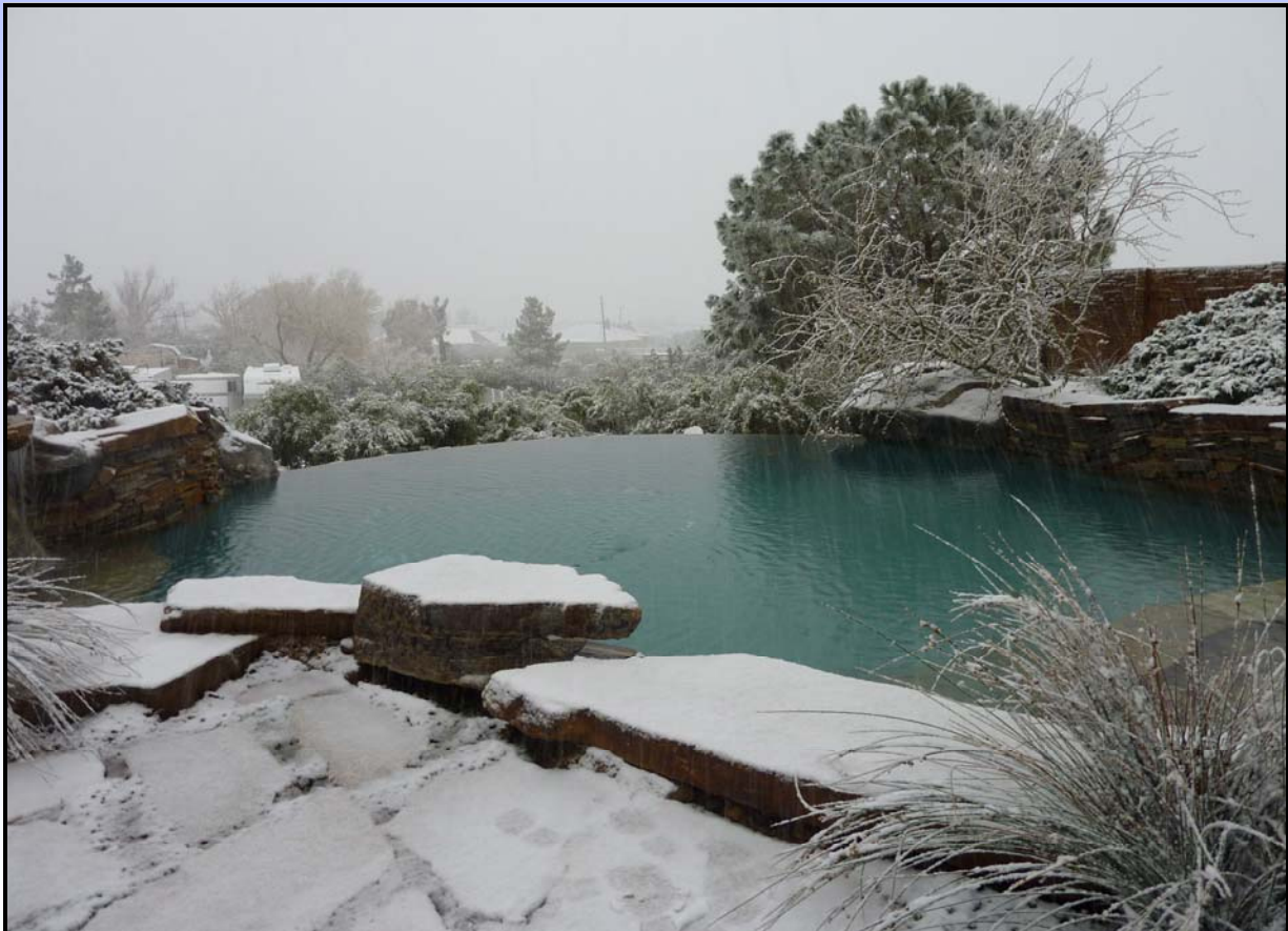
Nick Williams Designs–Winter Pool