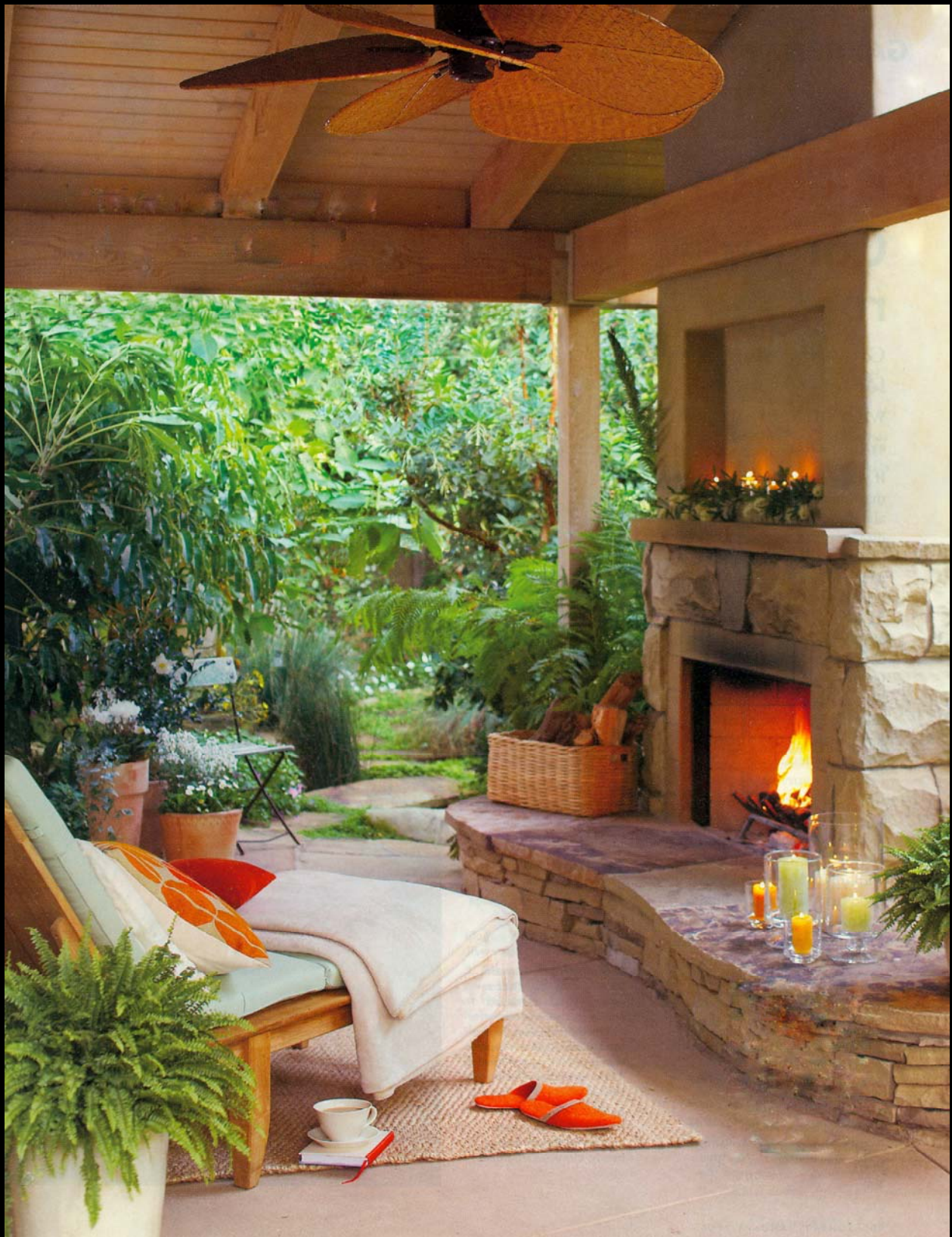
Sunset Magazine: Cozy Winter Patios