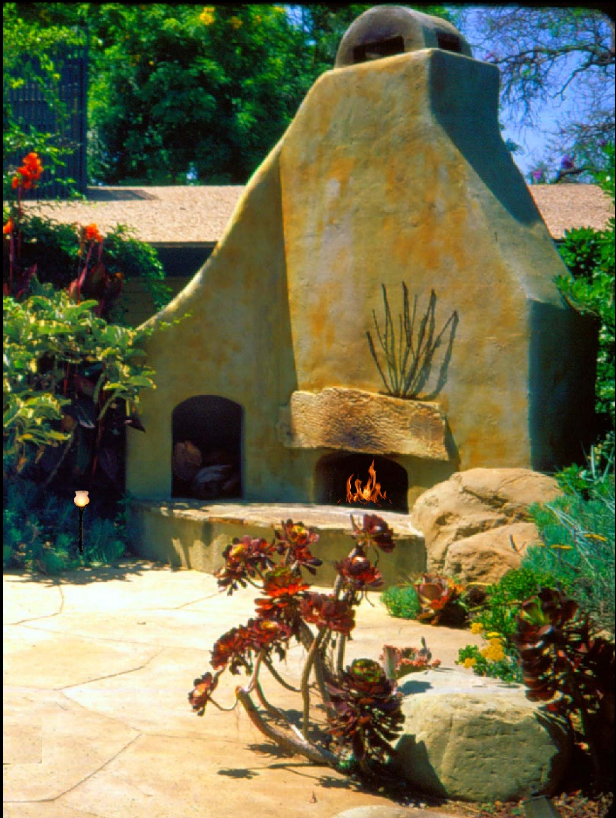
Los Angeles County Arboretum Sunset Demonstration Gardens