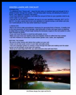
WINTER GARDENING TIPS

Click below for other Winter Tips and Articles