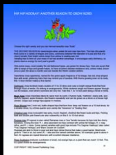
ANOTHER REASON TO GROW ROSES