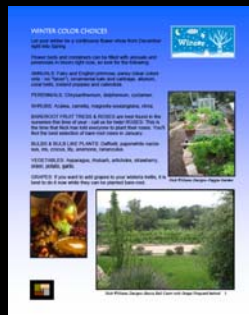
WINTER COLOR CHOICES