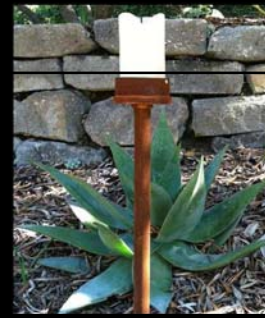
IRON PATH CAN-