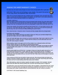
MAKING THE WISEST