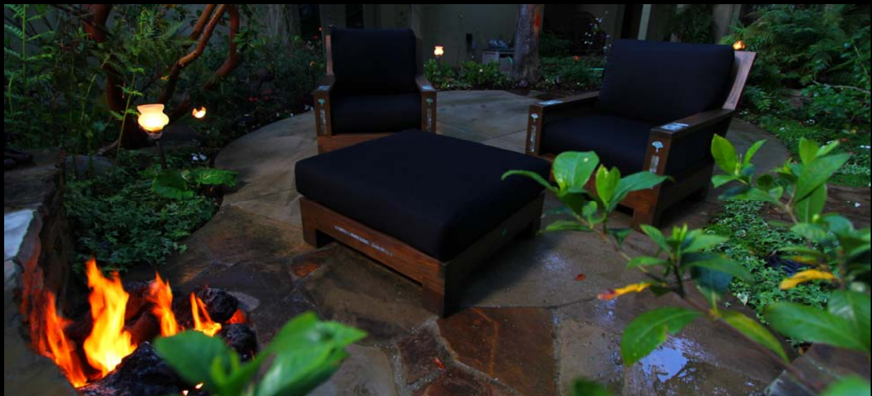
Nick Williams Outdoor Furniture and Lighting Collection

Of course, the holidays would not be complete without a strong focus on the element of fire. We have some great new photographs to spark your imagination, and maybe even make you wish you could pull up a chair and doze off by the fireside with dreams of sugar plums and reindeer! We showcase both outdoor rooms and patio settings with fireplaces and fire pits, a real fantasy land of color, mood and theme. The use of firepits, often placed out on the edges of designed spaces, invite your guests to venture out from all the activity to gather for quiet conversation, while the outdoor fireplace provides a wonderful gathering space for groups.