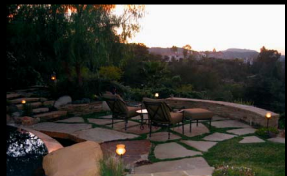
Urn Lighting