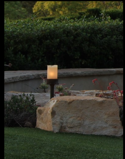
Candle Path Light

Other choices include the “Mica” and “Urn” path lights, using similar styling in bronze to achieve a weathered, yet elegant, finish that blends naturally with the landscaping.