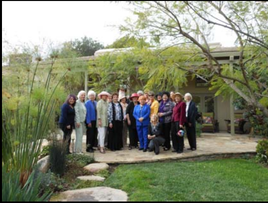
Westlake Garden Club