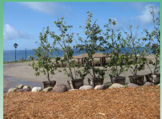
New Trees on the site donated by Boething Treeland

For authenticity, the work involved removal of most non-native plants brought here years ago from Europe and other areas around the globe.