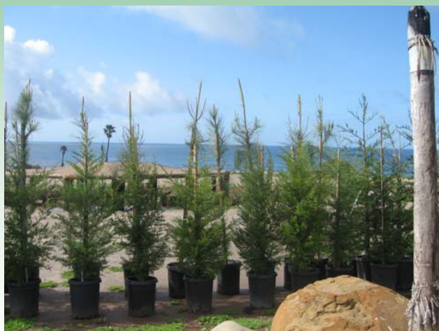
New trees donated by Boething Treeland

Chumash used Toyon berries for both roasted and dried food. Its hard wood was fashioned into a variety of tools, used for digging, fuel, making dance sticks, cradle boards, harpoons, and also used in rituals.