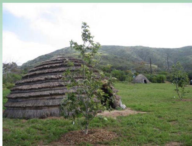
Chumash house called ' aps ' with a newly planted tree