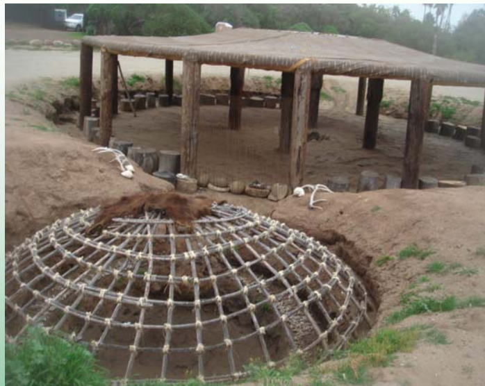
Sweat lodge - ap'a'yik

Simplicity in design, natural design, are at the heart of Williams' craft throughout his career. The land was cleared of illegally dumped concrete and trash by Mati and his local volunteers, removing the blight of our modern culture as a first step in bringing this 8,000 year old Chumash village back to life. Natural underground sources of water were found, and the site was designed to be a living example of simplistic and harmonious existence with the land, air and water; a way of life that is almost therapeutic when compared to our hectic modern lives, with a cleansing, spiritual approach to healing the land and ourselves as we coexist within.