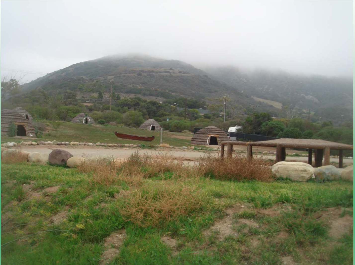
Wishtoyo's Chumash Village