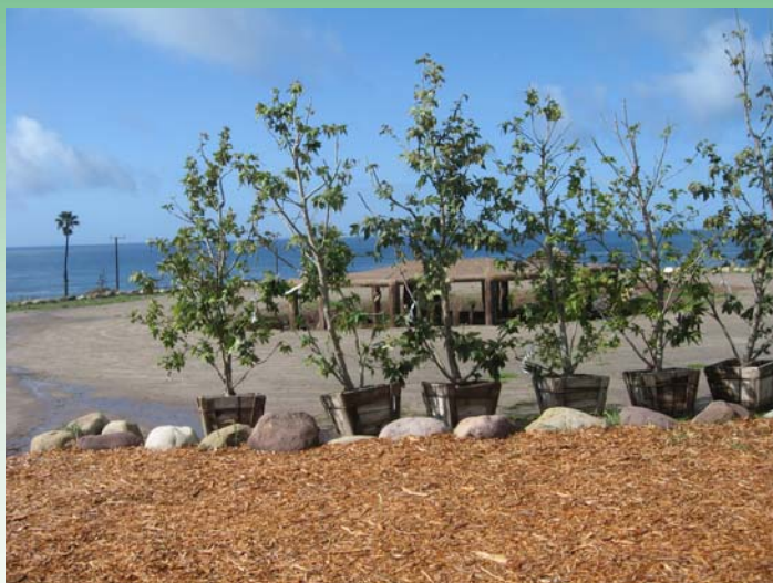
New Trees on the site donated by Boething Treeland