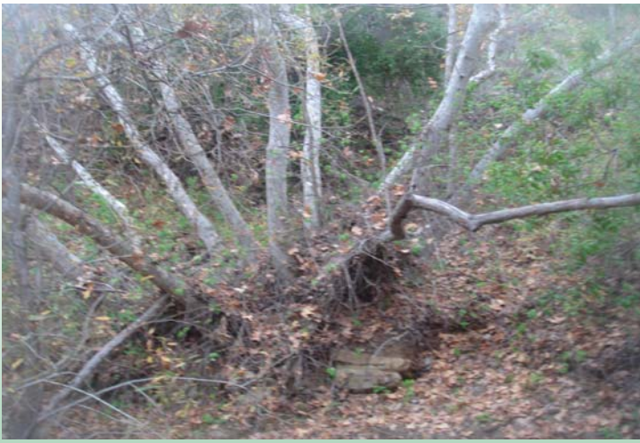
A 10 limbed Sycamore Tree on the site