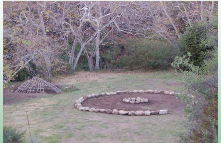
The new women's ceremonial circle and sweat lodge at the Chumash Village in Malibu with a Dracaena Draco Tree in the back