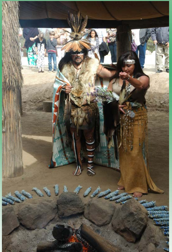
A ceremony at the Chumash Village in Malibu, in the sil 'Tyik,