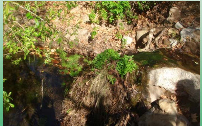
Stream found on the site after cleaning up dumped concrete,

It was important to make sure it was properly restored, with the emphasis that only native plants and materials be used in the restoration of the village. Boething Treeland, a long established plant nursery in Woodland Hills, made a very generous contribution of trees and native plants, including transportation and labor on the site to get everything situated and planted according to plan. With over 50 yrs experience, Boething Treeland, manages over 800 species of plants and specializes in "native only" plant requests or other special needs, such as low water usage plants. Their contribution of plants, materials, time and expertise was invaluable.