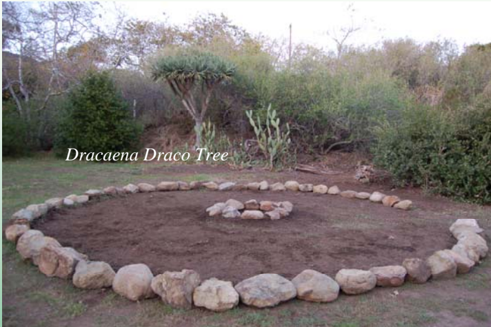
Dracaena Draco Tree