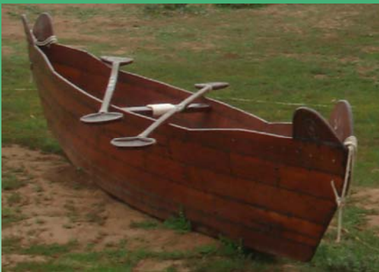
Redwood Canoe - Tomol