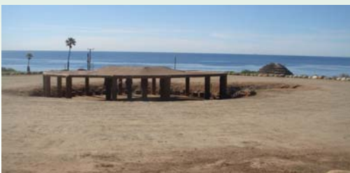
Ceremonial Circle sil'i'yik