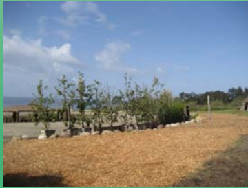
New trees donated by Boething Treeland

A species of cypress that is endemic to the Central Coast of California. In the wild, the species is currently confined to two small populations, near Monterey and Carmel, California. These two small populations represent what was once a very large forest on the west coast, so the addition to the site is a restoration for this species as well. The surviving trees from this forest are as old as 2000 years.