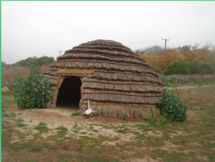
Ap with whale bone